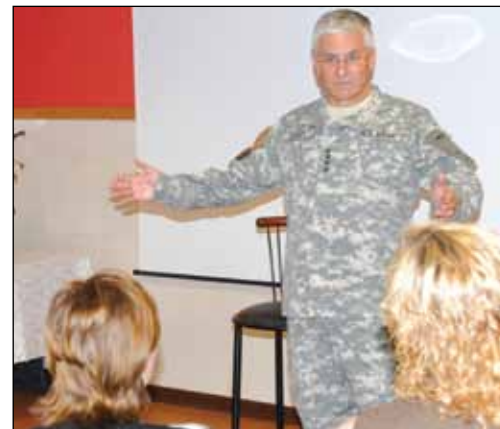
Chief of Staff of the Army, Gen. George W. Casey Jr., speaks with family members during a visit to U.S. Army Garrison Vicenza and U.S. Army Africa, Oct. 15.