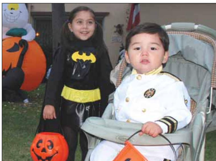
Children trick or treat at Villaggio at last year's festivities. The carnival will begin at 3:30 p.m. Trick-or-treating for ID card holders begins at 6, and 7-9 p.m. for the local Italian community.

For the safety of all participants, no private vehicles will be permitted to enter or leave Villaggio from 6-9 p.m. The road by the gate will be closed at 6 p.m. Parents picking up children will enter and leave via the same road.