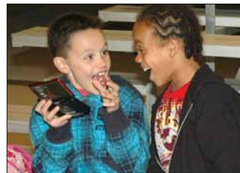
Chilly weather didn't cool spirits Oct. 13 as family members and friends waited at Hoekstra Field for the latest arrival of 173rd Airborne Brigade Combat Team Soldiers to return to Vicenza after a year deployment to Afghanistan. The Vicenza Military Community and friends and family arriving from the United States will welcome more paratroopers back to Italy over the coming weeks.