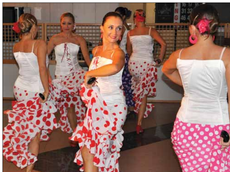
Prosaenium Dance School from Pisa, Italy, performs for the Camp Darby community during the Hispanic Heritage Food tasting event Oct. 15.

The event included Mexican art examples of Dia de los Muertos (The Day of the Dead) by the Livorno Unit school children and dancers from the Prosaenium Dance School in Pisa, along with piñatas for the kids.